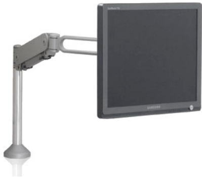
M4 Flat Panel Monitor Arms