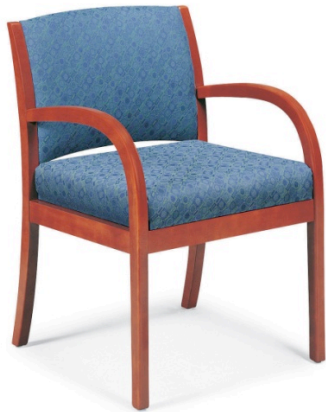
24" w Bariatric Chair