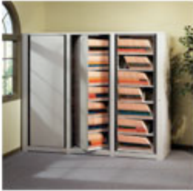
Arc™ Rotary Files