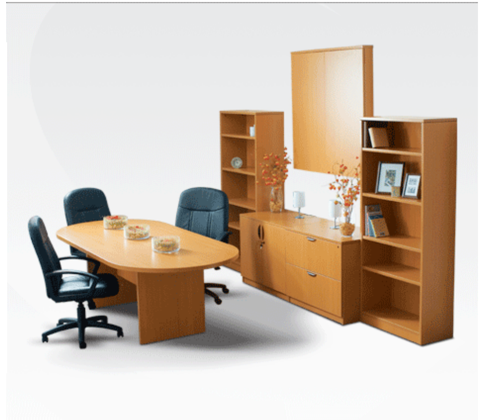
Table & 5 Pieces – Unit cost $1317.00