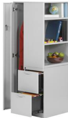
Wardrobe + Storage