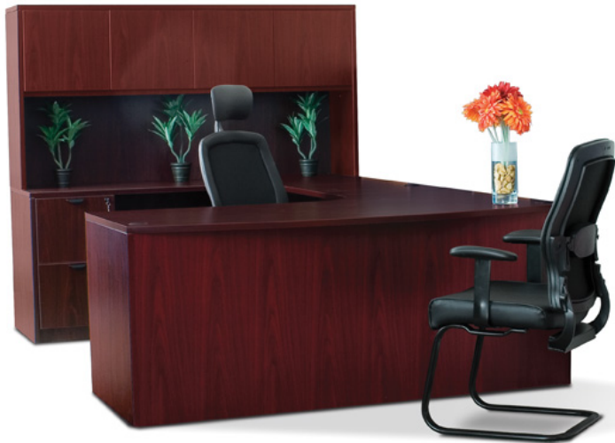
U-Unit/Hutch -Unit cost $903.00