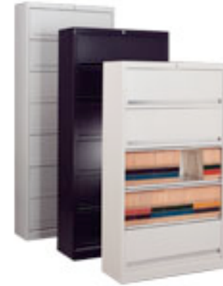
Flip n File